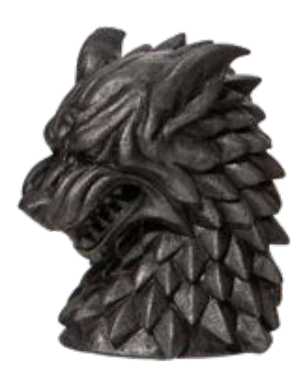
6010334 HOUSE STARK BOOKENDS Height 15.5cm 👚